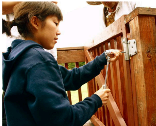
▲ A youth installs a gate on the Table Bluff Rancheria in Northern California.