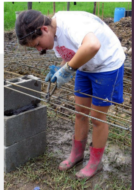
▲ A youth cuts rebar in Honduras.