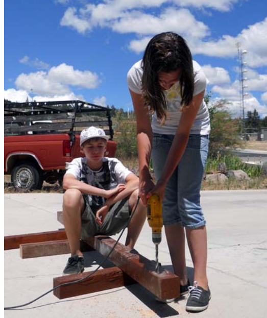
▼ A Senior High work team in Fort Hall, Idaho with a completed wood shed.