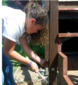
▲ A youth installs a bolt on the Table Bluff Reservation in Northern California.