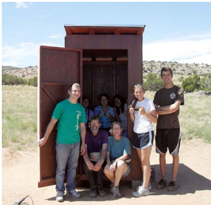
▲ Work team in Teec Nos Pos, Arizona with the completed outhouse they helped build.