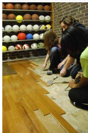
▲ Youth install a new hardwood floor at the Aspire Alexander Twilight College Preparatory Academy in Sacramento.