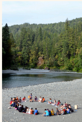
Smith River, California