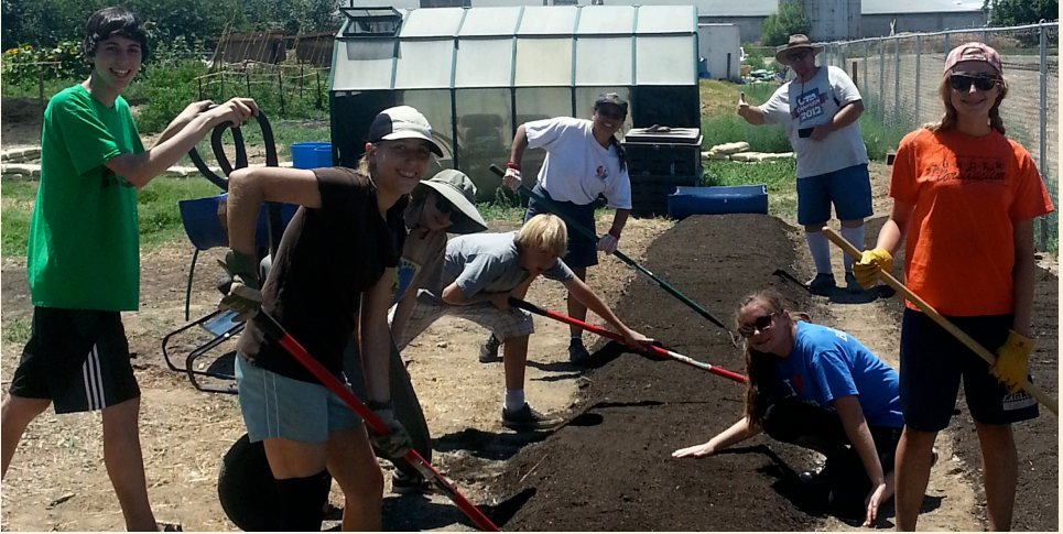
Team builds a garden bed for vegetables at Boggs Tract Community Farm in Stockton.

“The atmosphere at SSP is just amazing. I can feel God’s presence in each and every youth, counselor, and staff member. This week really opened my eyes to Stockton and ‘just serving’ in my community.”