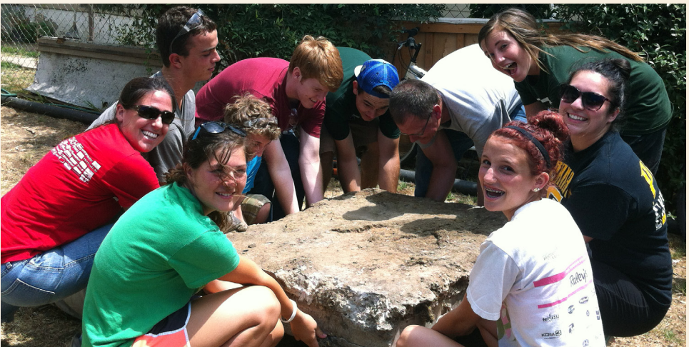
Work team removes old concrete at Essence of Light, a nonprofit in South Los Angeles which provides post-addiction transitional housing.

Youth from Good Samaritan United Methodist Church Cupertino, California