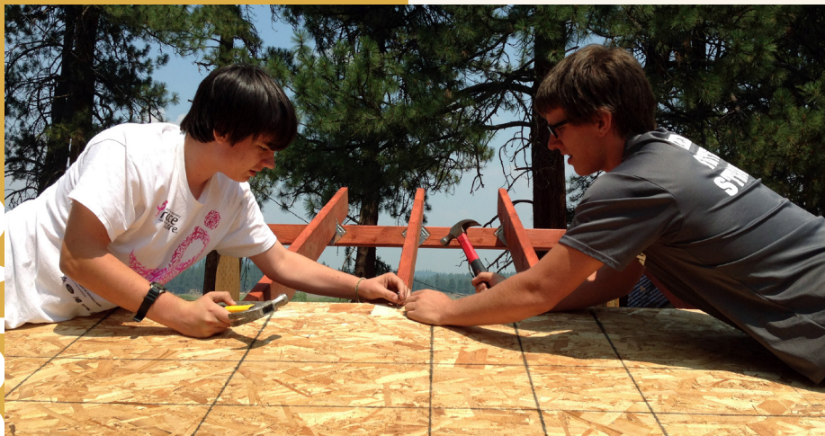
Youth roof a wood shed outside of Chiloquin, Oregon for a community member.

“What a great week! I feel that SSP was a really wholesome experience. It helped me see Christian values in a very relevant way, and I’m so glad I learned how to use a power drill. I really want to come back!”