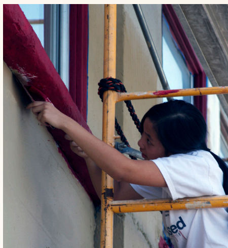
Youth paints facade of Crossroads Ministries on Main Street in Susanville, California.