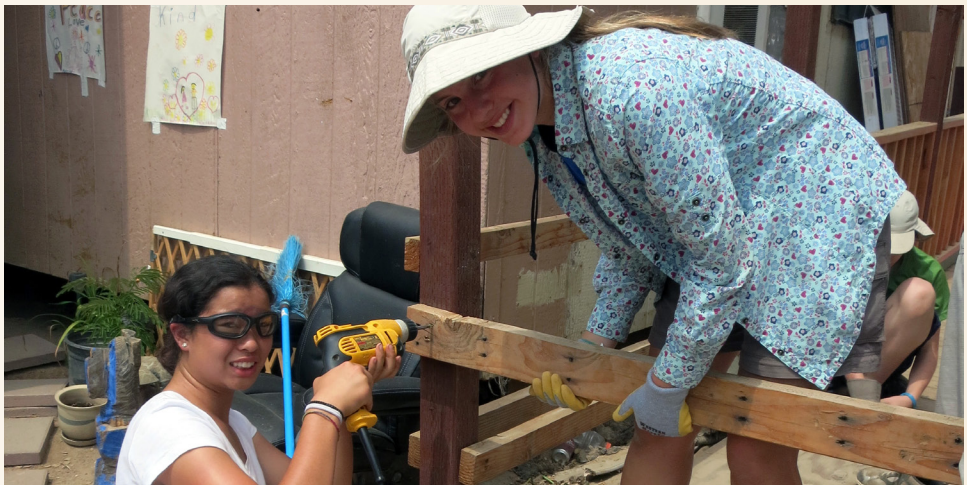
Junior high youth repair a wheelchair ramp in Coarsegold, California.

Over 130 Repair Projects 100 Homeowners 30 Community Organizations 2,000 Youth & 400 Adult Leaders 45 Young Adult Staff