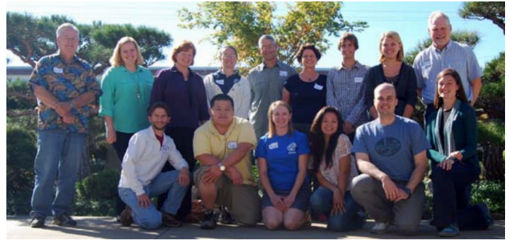
▲ 2013 Board Members and Staff

San Diego First UMC San Jacinto UMC Seal Beach UMC Sierra Grace UMC Sierra Pines UMC Smith River UMC St. Matthews UMC Trinity UMC, Sunnyvale